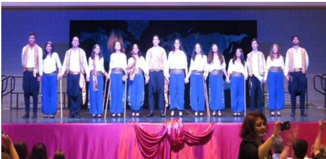
Teen Group... not so teen anymore!