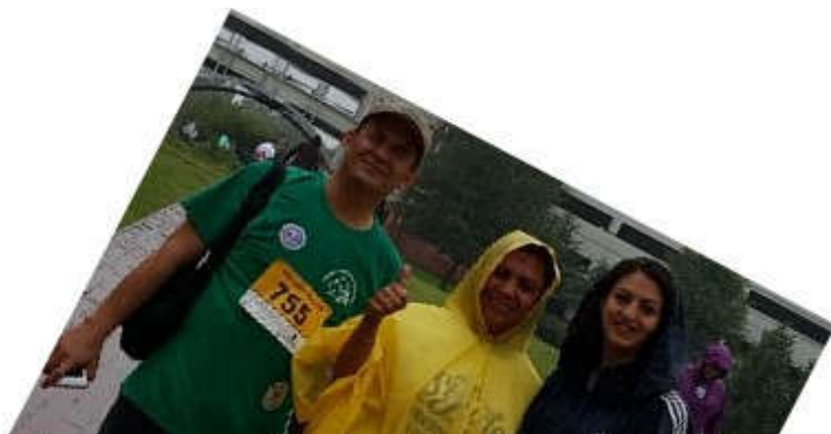
Below (lost picture from St. Jude walk)